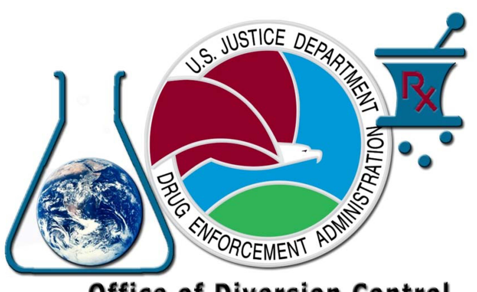
Office of Diversion Control